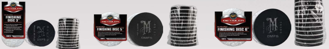
2 PACK 3" DISC: DMF3 12 PACK BULK 3" DISC: DMF3B 2 PACK 5" DISC: DMF5 12 PACK BULK 5" DISC: DMF5B 2 PACK 6" DISC: DMF6 12 PACK BULK 6" DISC: DMF6B

Microfiber disc technology refines surfaces to a high gloss finish Best on flat surfaces