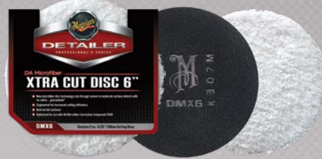
2 PACK 6" DISC: DMX6