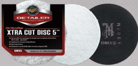
2 PACK 5" DISC: DMX5

Best for flat surfaces Optimized for use with Meguiar's® Detailer DA Microfiber Correction Compound